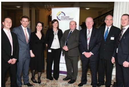
Members of Ireland Northwest Management Team at the Diaspora event in Boston

It was also intended that at the end of each programme, participant businesses would be signposted to additional programmes, supports and interventions from other agencies.